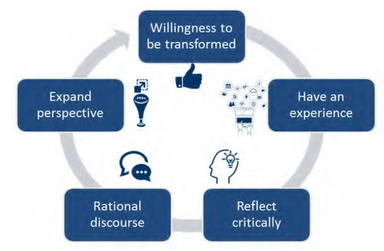
Elements of Transformative Learning

recording students' Transformation Learning (TL) growth in five core tenets (or competencies). While the traditional academic transcript gives a snapshot of students' Discipline Knowledge , STLR captures students' growth in five other competencies (see <u>STLR Competencies</u>).