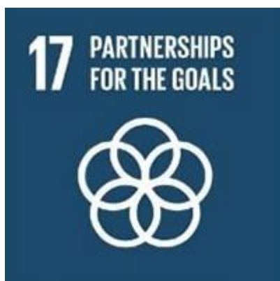
SDG Goal 17 Partnership For The Goals