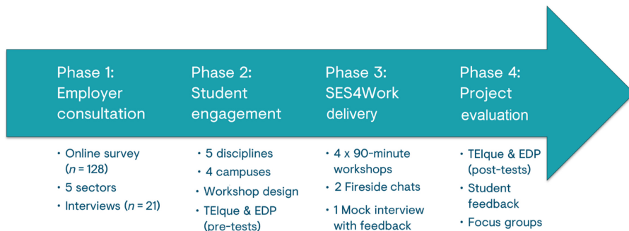
Figure 1. Socio-emotional skills for work: research design

asked to reflect on their scores, giving examples of their strengths (areas where they recorded a 6 or 7) and considering actions to take where they recorded a 4 or less. The TEIQue (Petrides, 2014) is a self-report questionnaire consisting of 153 items (rated on a seven-point Likert scale) and 13 facets, organised under four factors: well-being, self-control, emotionality and sociability. In addition, the number of students “hired” by employers in mock interviews post-intervention also supplied a direct measure of the module’s effectiveness.