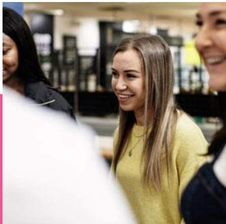
Living with an Owner Occupier