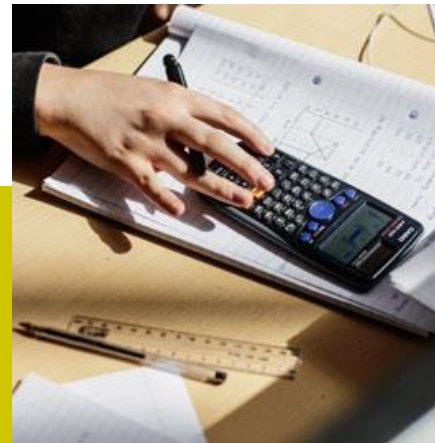
Renting Private Accommodation