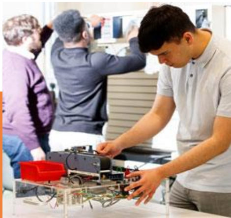
Purpose Built Student Accommodation (PBSA)